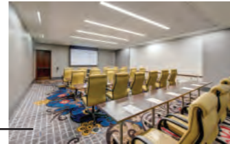
Belltown Meeting Room