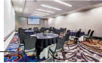
4th Floor Break Station